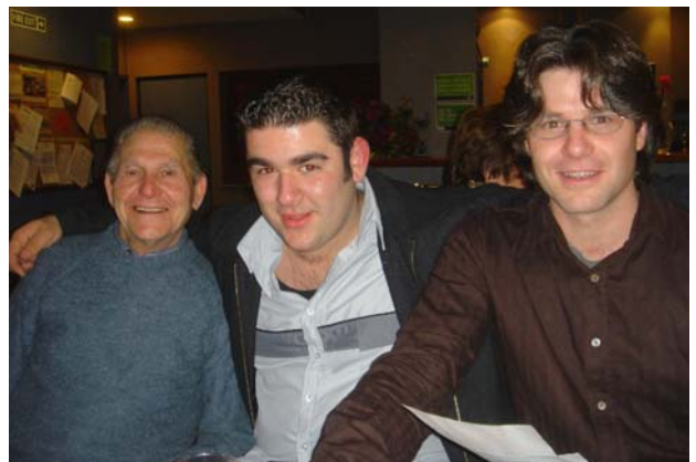
The Benvenuti boys!