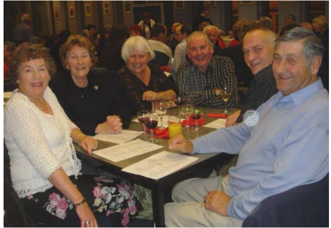
Lots of lovely smiles!