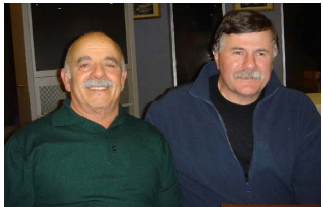
Fifi & Lib with matching mo's!