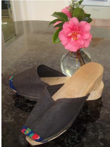
Original hand-made Italian zoccoli

In the 15th century the first zoccoli appeared in Italy. At that time zoccoli had a 20cm heel in the rear and a kind of high plateau in the front. Probably the first zoccoli might have been also the first high heels! It was very difficult to walk in those zoccoli, but of course they were pretty stylish and so zoccoli became popular in the trend-setting city centres of style, arts and culture like Venice.