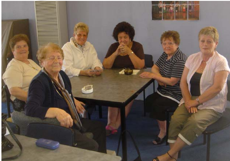
The girls, preparing for a serious game of cards