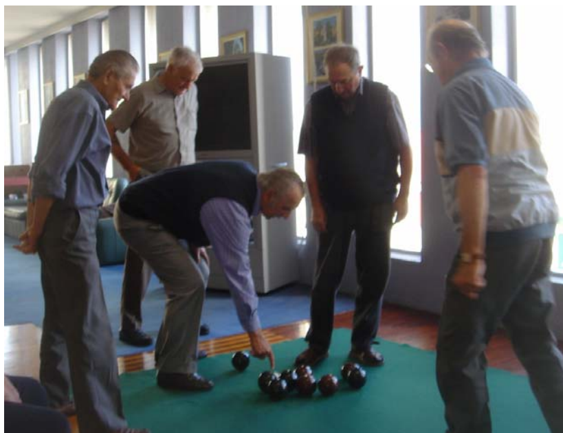
"I want you to put the next ball, right here"