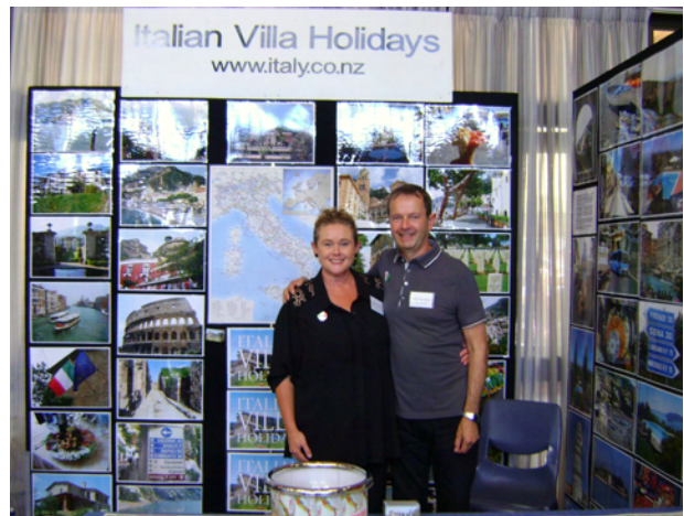
Italian Villa Holidays Stand