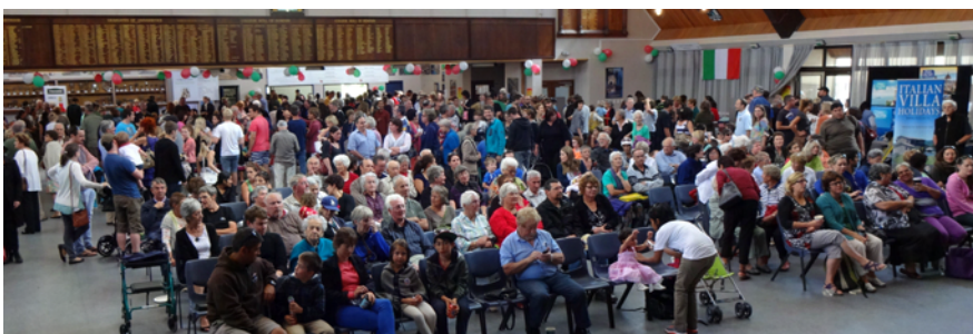
Enjoying the entertainment