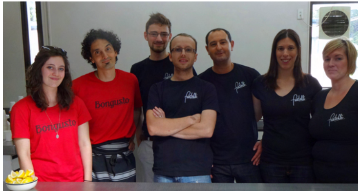
Some of the Bongusto and Fratelli crew