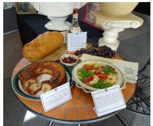
A typical Tuscan meal