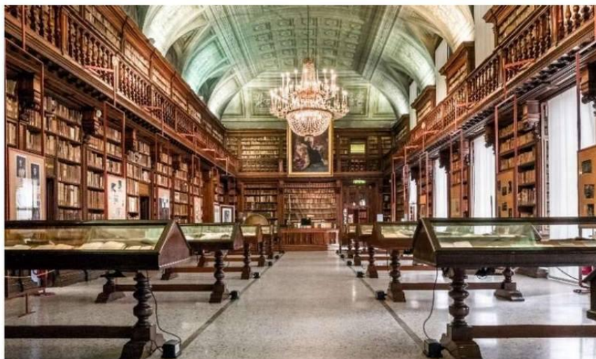
Braidense Library, Brera, Milano, created in 1770 for Maria Theresa of Austria