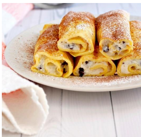
Dita degli Apostoli pugliesi