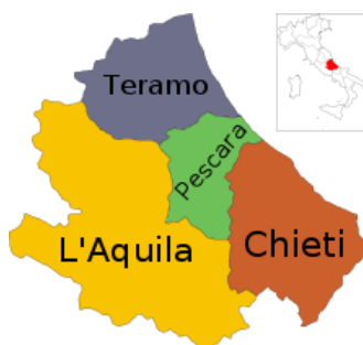
Provinces of Abruzzo

A type of cheese puff from Abruzzo served at Easter