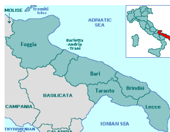
Provinces of Puglia