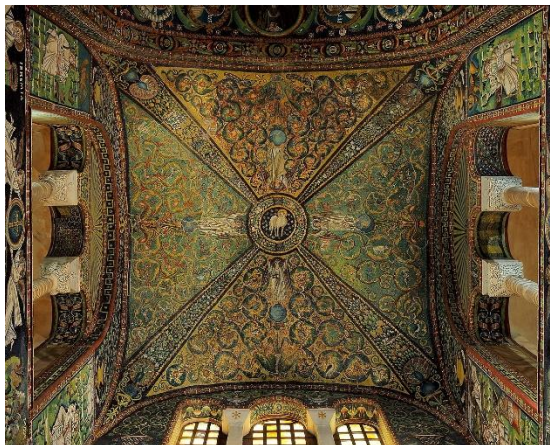
Presbytery mosaics, San Vitale Ravenna, AD 6th century