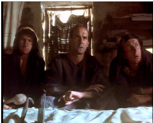
‘What have the Romans ever done for us?’ (John Cleese from Monty Python’s Life of Brian )