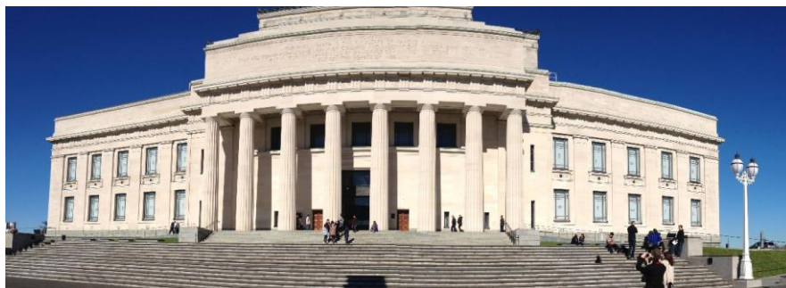
Auckland Museum, begun 1925

Garibaldi House Level 2, 118 Tory St/cnr Vivian St. Note no parking before 6pm!