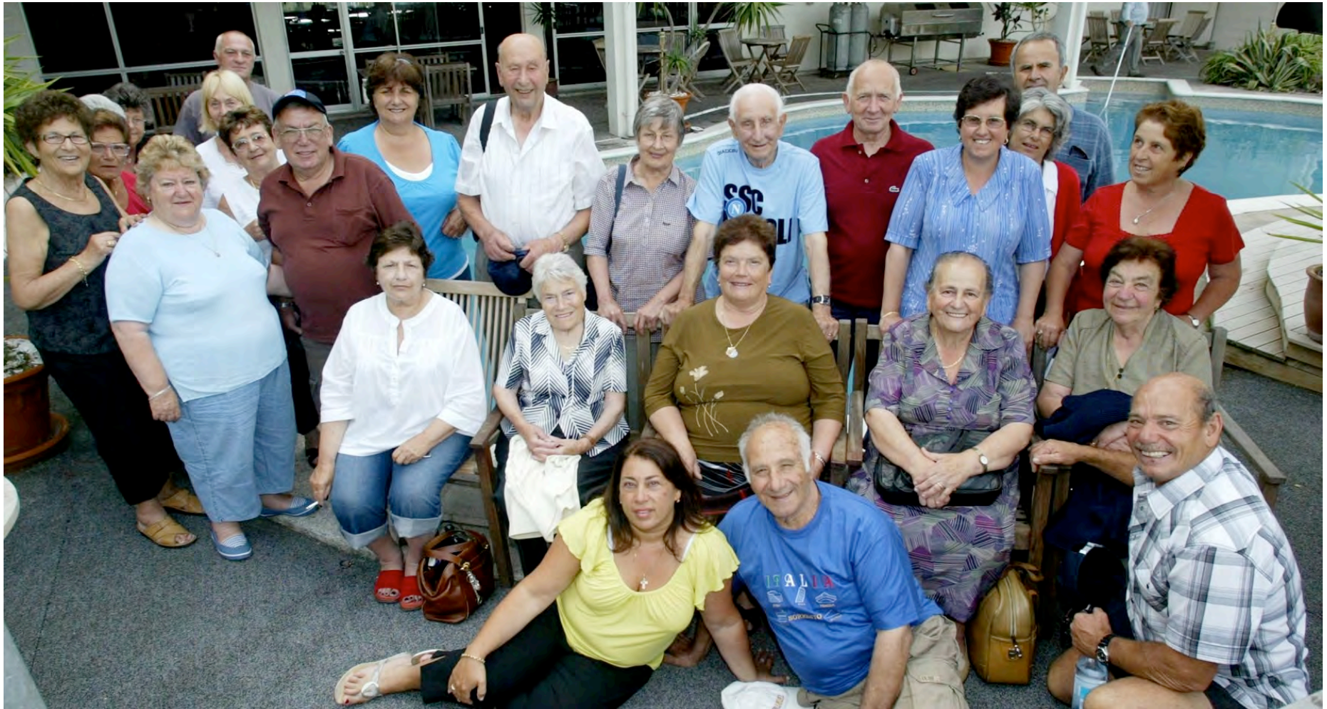
Bus Trip photograph which appeared in the Bay of Plenty newspaper.