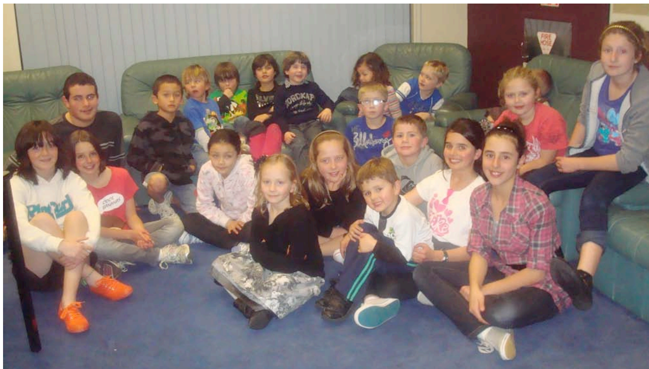
Some of our young Garibaldini at Family Night