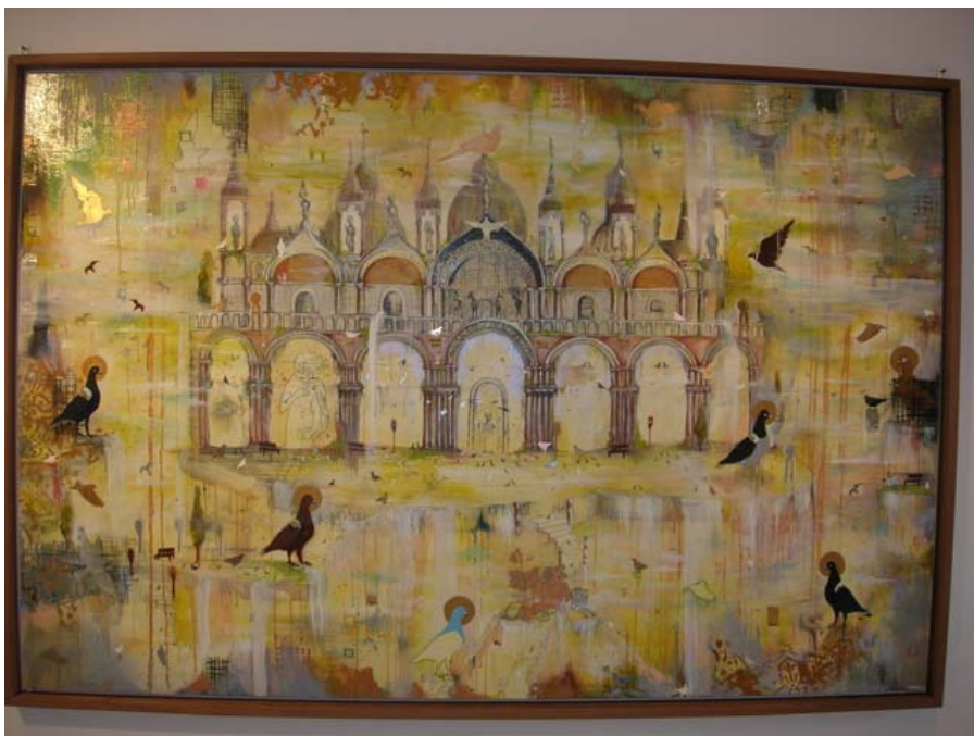
This photo of Veronica's painting, entitled 'Casa Nostra' which is 2 metres long, sold immediately