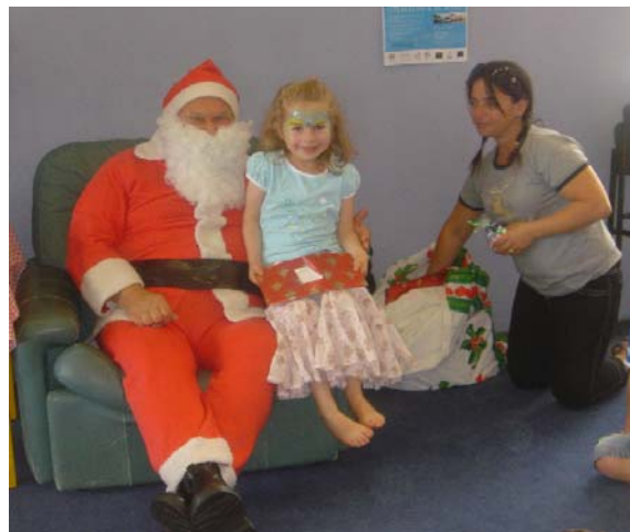
Santa with another pretty young girl