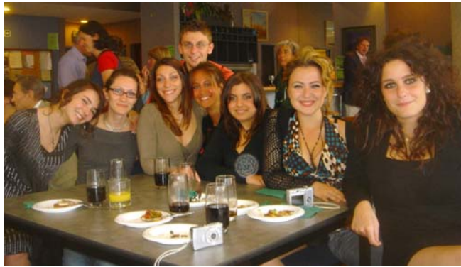
A group of our visitors

Another wonderfully successful function at Club Garibaldi!