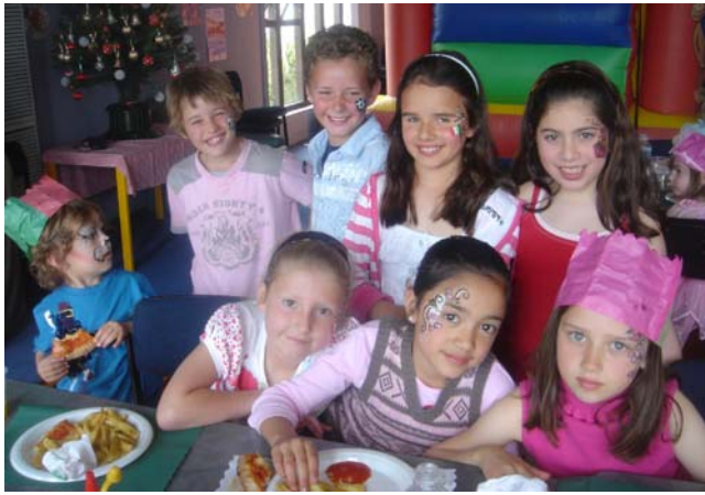
Smiles, hats & food = good fun!