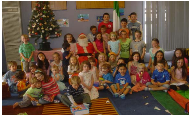
All together now ... Smile!