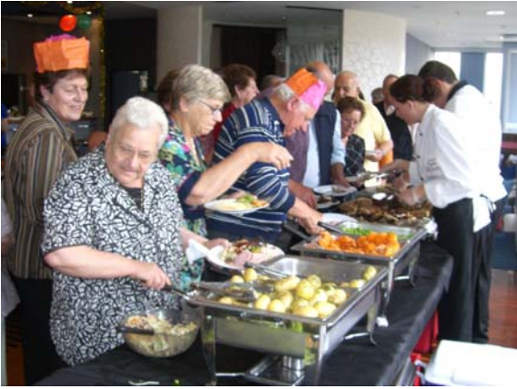
Members at the buffet table