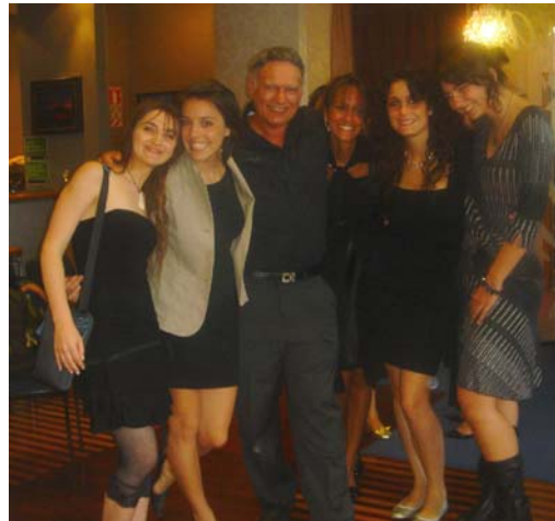
Robin looking after the girls!