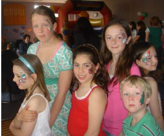
5 pretty girls and one handsome lad