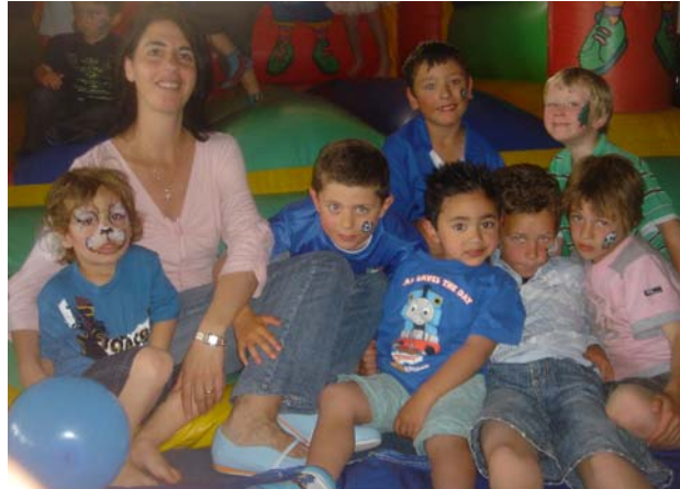
Having a wee rest!