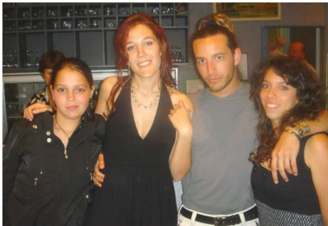
There were some guys as well!