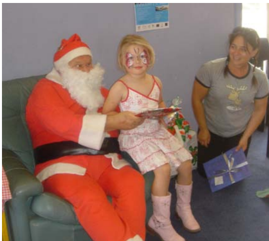
Santa with a pretty young girl