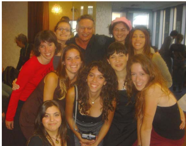
Robin's comment: Well someone had to do it!