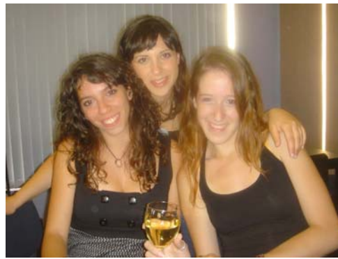
Three beauties smile for the camera