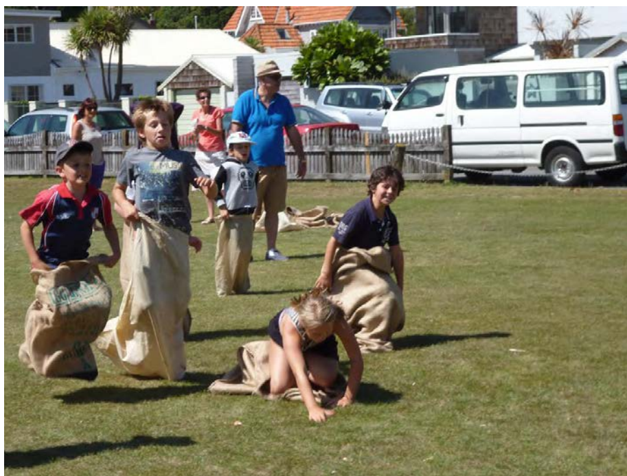
Showing their best sack jumping style are the six to nine-year-olds at the picnic.