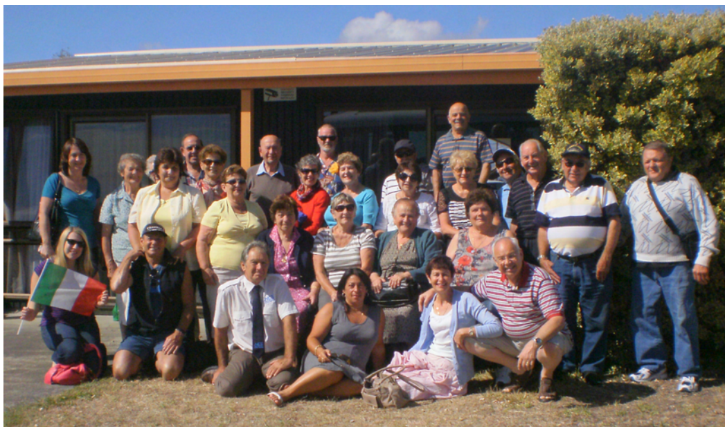
The Happy Travellers