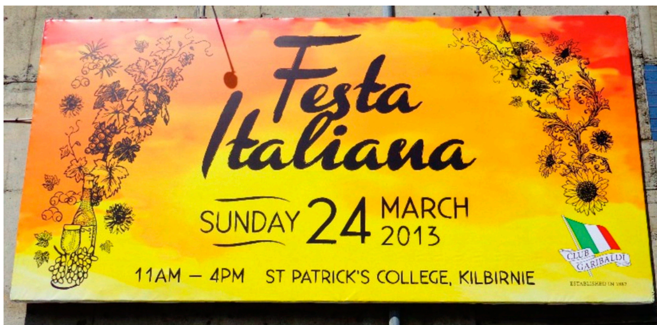
Billboard on the outside of clubrooms wall, above the car park.