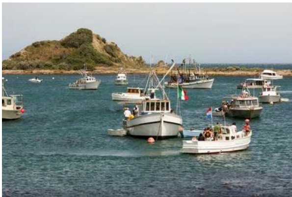
Photo taken at the 2010 Island Bay Blessing of the Boats.

All are welcome to attend a small ceremony to unveil a memorial seat to commemorate the 'Santina' fishing launch and its crew of four, who were lost at sea in Wellington Harbour on 25 September 1933.