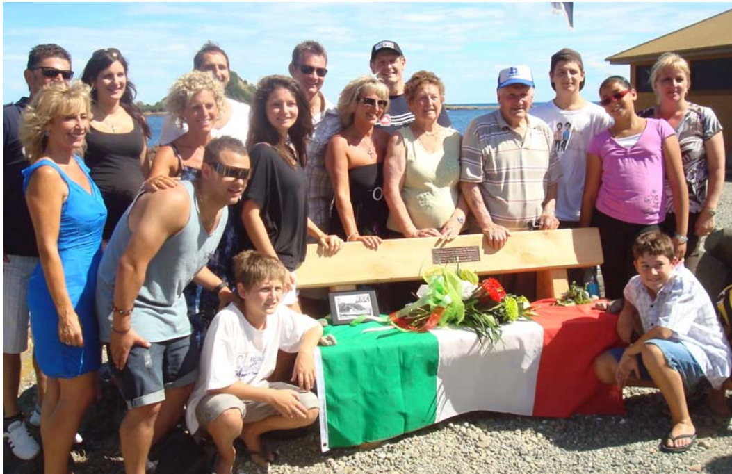
Some descendants of the Amitrano family