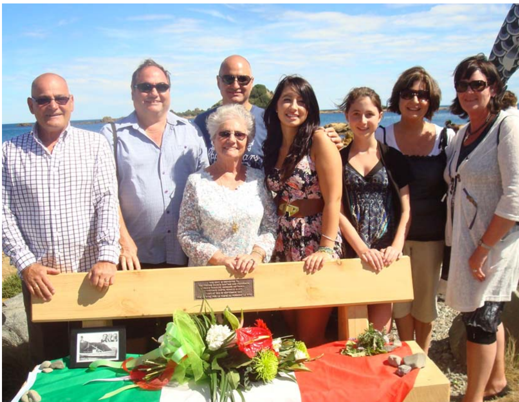
Some descendants of the Costa family