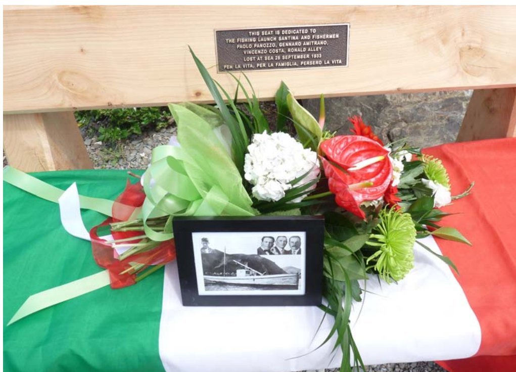
The dedicated memorial seat at Island Bay

I would like to thank all that attended and showed their respect and love to the Costa and Amitrano families. It was truly appreciated.