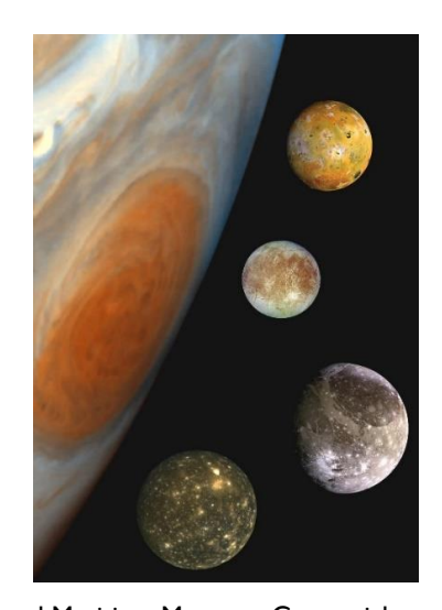
Domenico Tintoretto, Galileo Galilei , c. 1602-07, National Maritime Museum, Greenwich Jupiter's four Galilean moons, composite image, Io, Europa, Ganymede, Callisto <u>Galileo Galilei - Wikipedia</u>

Galileo Galilei (1564-1642) claimed that planet Earth revolved around the Sun. The then Church authorities placed him under house arrest for the rest of his life, but in 1992 Pope John Paul II addressed the mistakes the Church had made in its handling of his case and moved towards vindicating his name.