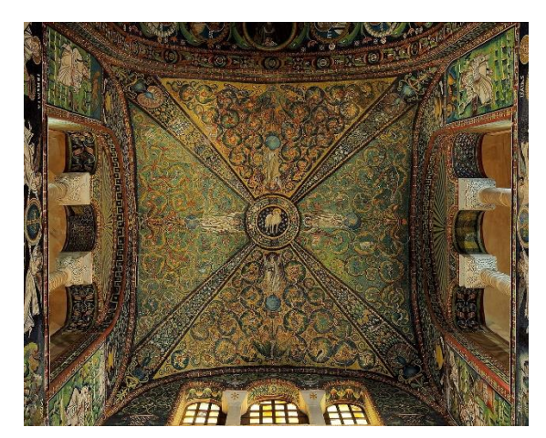
Presbytery mosaics, San Vitale Ravenna, AD 6th century

As we are unable to travel to Italy at present, if you would like to explore the history, art and architecture of five of its most famous cities and their celebrated churches, come on our lecture tour at Club Garibaldi Wellington instead.