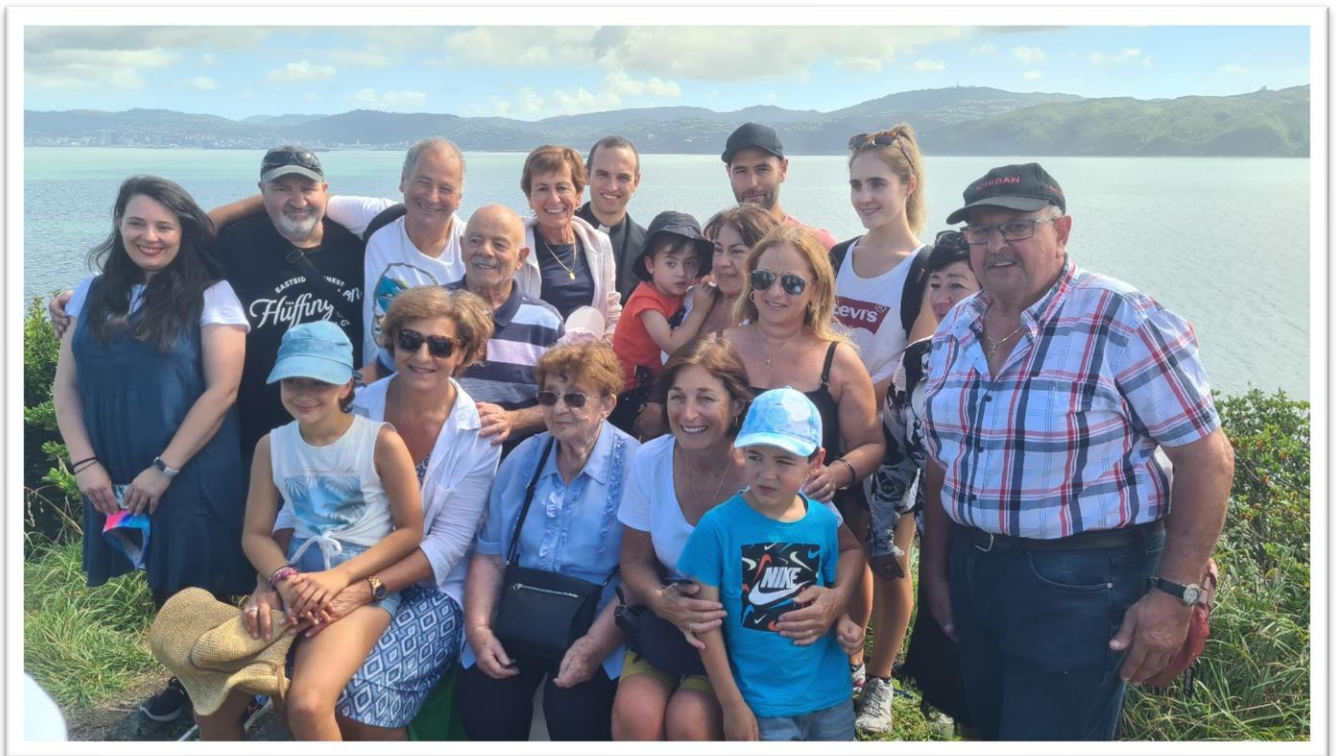
The descendants of those interned on the Island.

After the ceremony the group scattered around the island, visiting the small museum, the lighthouse and the buildings used for quarantine purposes. Staff at the Department of Conservation provided some rustic transport (a gardening tractor) for Fifi and Lucia to get up and down the hill which was much appreciated! No one was left behind when the East by West ferry took everyone back to Queen's Wharf.