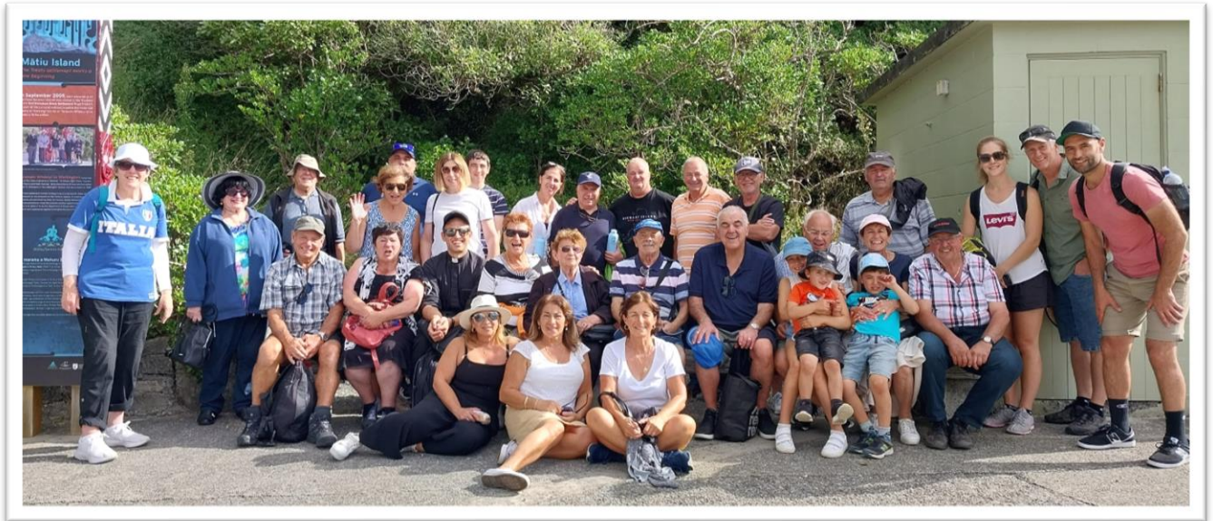
The Garibaldi crew that went to the island on the Memorial Day